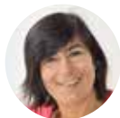
Host: Lidia Serras Portuguese Food and Wine Expert